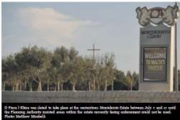
Il-Fiera I-Kbira was slated to take place at the prestigious Montekristo Estate between July 7 and 17 until the Planning Authority scooped areas within the estate currently being redeveloped could not be used.