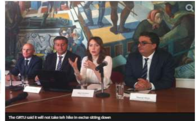
The GRTU said it will not take teh hike in excise sitting down